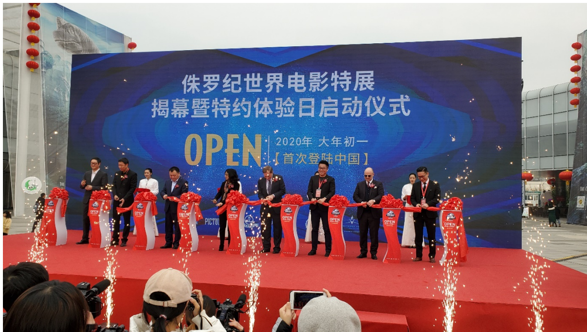
Opening Ceremony held on 20 th January 2020 in Chengdu