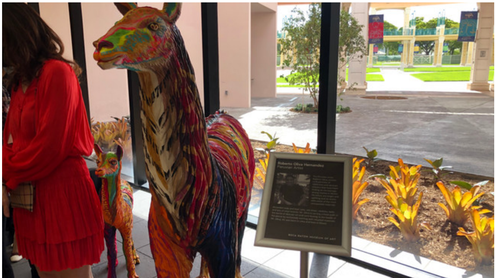
Machu Picchu exhibit in Boca Raton. (WPEC)

See also: 9-year-old boy helps save family from pond crash